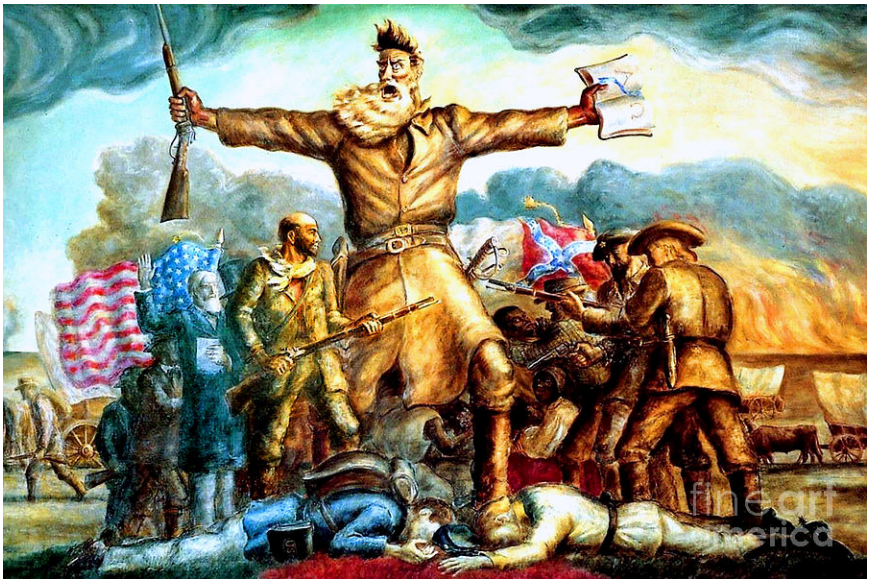
John Brown fought for the freedom of his fellow countrymen on the Kansas frontier

It should be noted that the US Civil War and the American revolution itself were both preceded by mass episodes of spiritual rebirth. The First and Second Great Awakenings were explosions of Christian revivalism that called for the country to turn around, repent from its ways, and recommit itself to the principles of equality and justice.