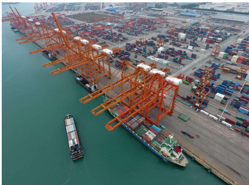
The Port of Qinzhou has been built using the growth mindset of the Government of China