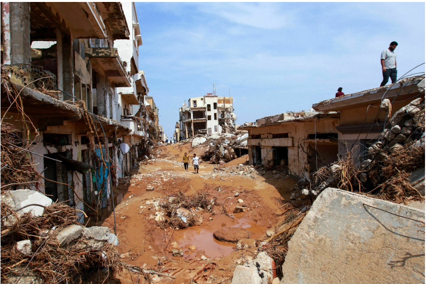
In 2011, NATO bombing reduced Libya, which had the highest living standard on the African continent, to rubble and chaos.

However, in 2011, Libya was destroyed by a US-backed "revolution." The country was forcibly "de-grown" with NATO bombs. Now the country is in ruin, with open-air slave markets,